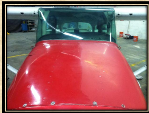
Before and After Polishing

You also want to make sure your aircraft looks the best and is protected from the summer sun. Wagner aircraft offers a full range of aircraft cleaning from a simple wash to full detailing jobs.